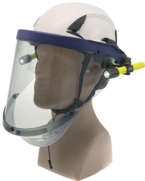
Shield in Deployed Position