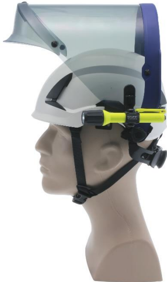
Shield in Stowed Position