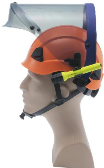
Shield in Stowed Position