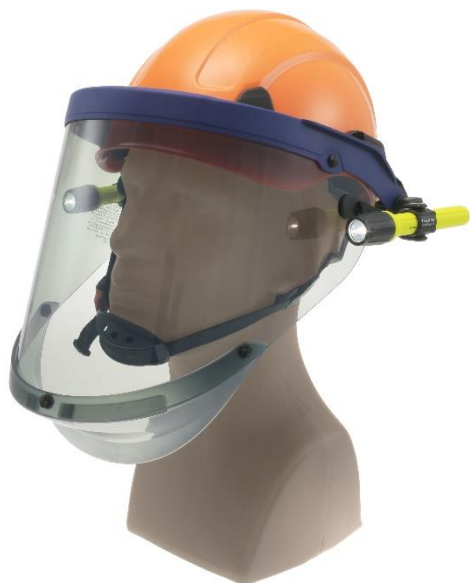
Shield in Deployed Position