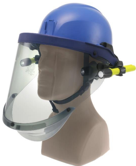
Shield in Deployed Position