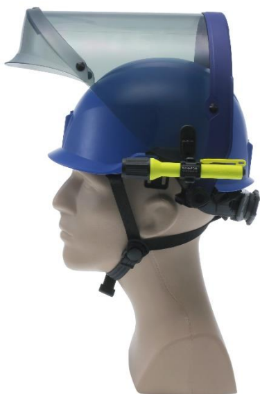
Shield in Stowed Position