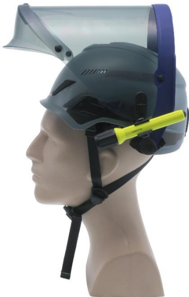
Shield in Stowed Position