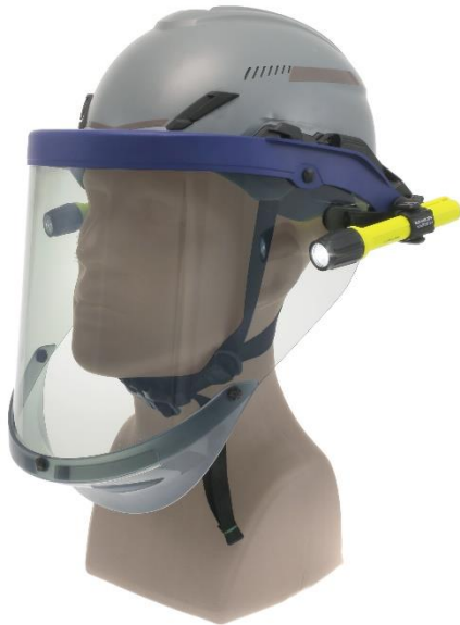
Shield in Deployed Position