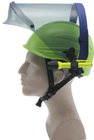
Shield in Stowed Position