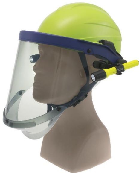
Shield in Deployed Position