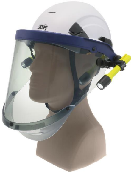
Shield in Deployed Position