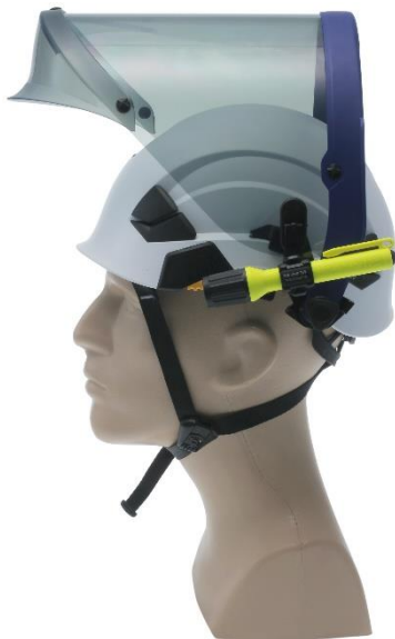
Shield in Stowed Position