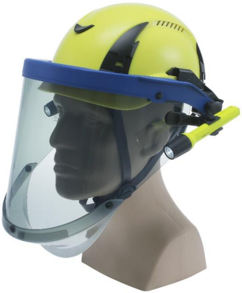
Shield in Deployed Position