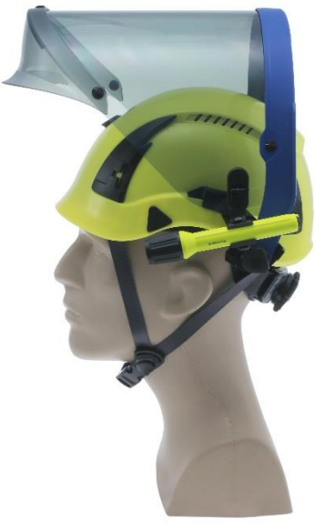
Shield in Stowed Position