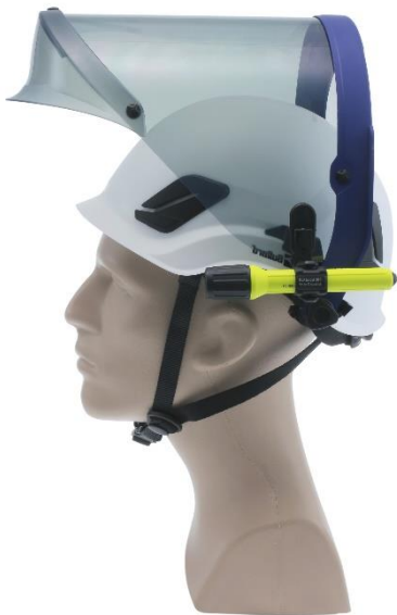
Shield in Stowed Position