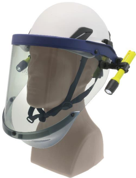
Shield in Deployed Position