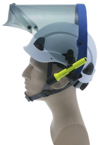
Shield in Stowed Position