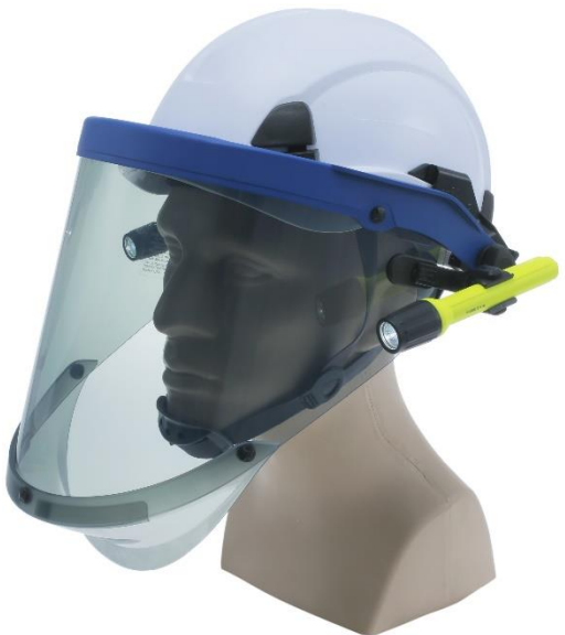
Shield in Deployed Position