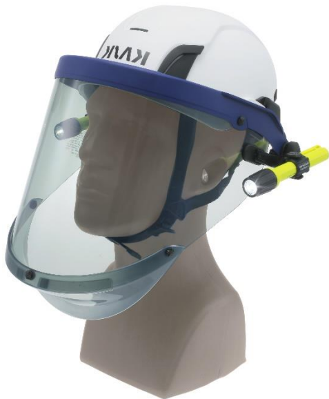
Shield in Deployed Position