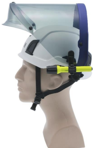
Shield in Stowed Position