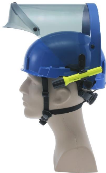
Shield in Stowed Position