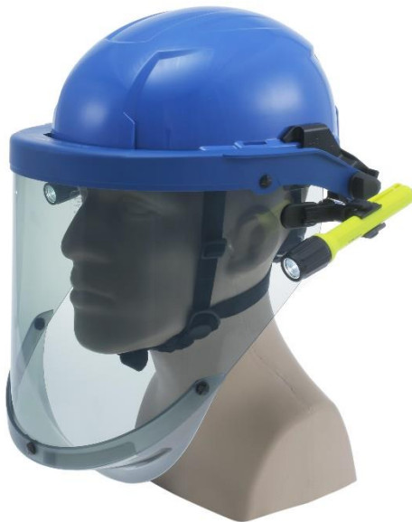
Shield in Deployed Position