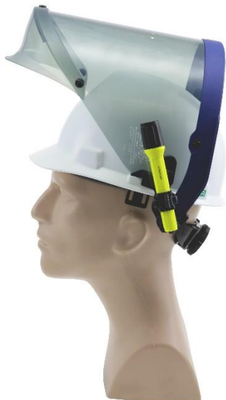
Shield in Stowed Position