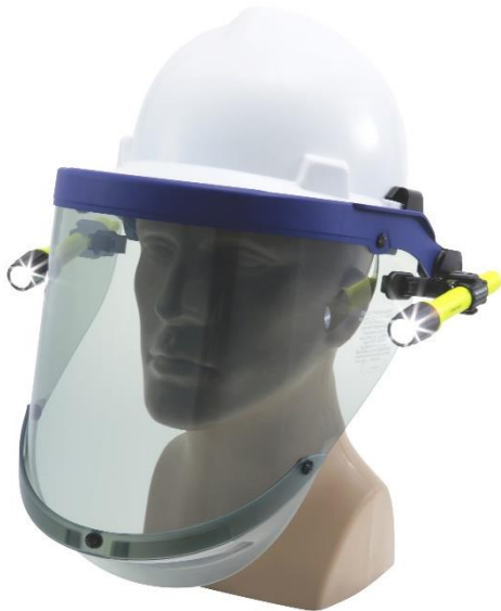
Shield in Deployed Position