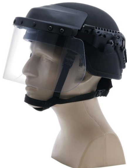
Shield in deployed position