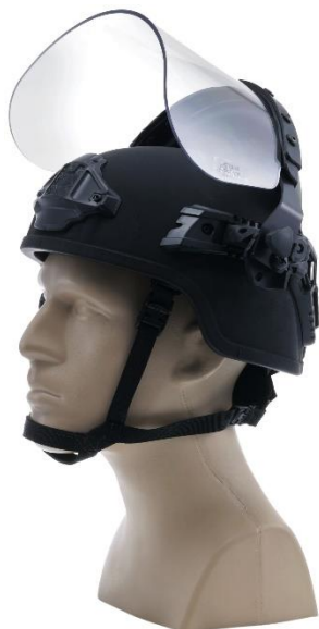
Shield in stowed position