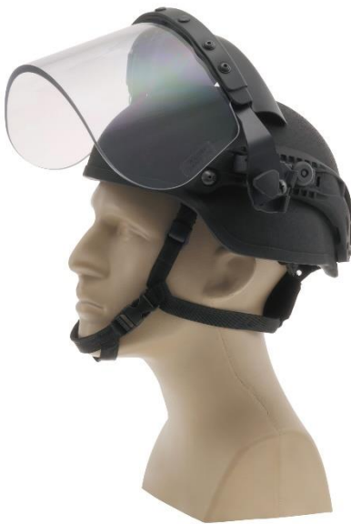
Shield in stowed position