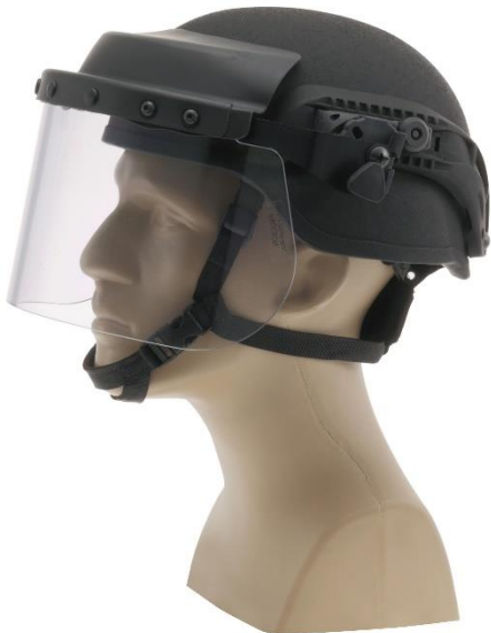
Shield in deployed position