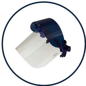
Shown with IM9-L6F Clear Face Shield & CB2-HD Slotted Cap Bracket