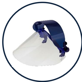
Shown with IM22-L6F Clear Face Shield & CB2-HD Slotted Cap Bracket