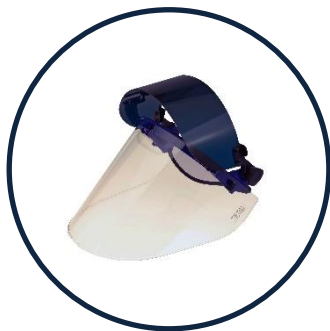
Shown with IM22-L6F Clear Face Shield & CB6-HD Universal Cap Bracket