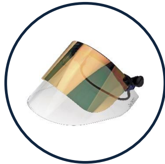
Shown with IM22-L6F Clear Face Shield & CB6-HD Universal Cap Bracket