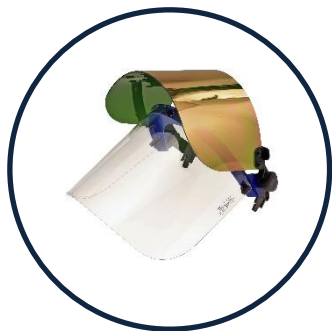
Shown with IM9-L6F Clear Face Shield & CB2-HD Slotted Cap Bracket