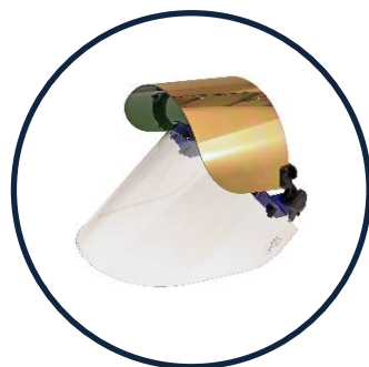
Shown with IM22-L6F Clear Face Shield & CB2-HD Slotted Cap Bracket