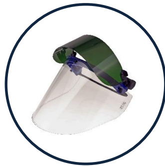
Shown with IM22-L6F Clear Face Shield & CB6-HD Universal Cap Bracket