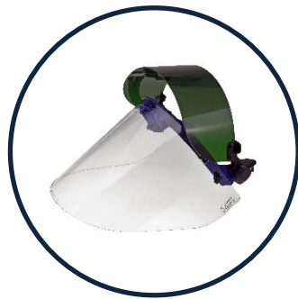
Shown with IM22-L6F Clear Face Shield & CB2-HD Slotted Cap Bracket