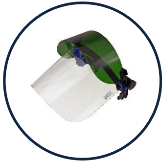
Shown with IM9-L6F Clear Face Shield & CB2-HD Slotted Cap Bracket